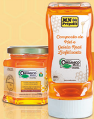
Honey with Royal Jelly 200g, 280g & 550g

Ingredients: Organic Honey and Organic Propolis