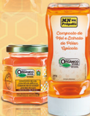
Honey with Bee Pollen 200g, 280g & 550g

Ingredients: Organic Honey and Royal Jelly