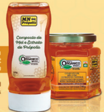
Honey with Propolis Extract 200g, 280g & 550g

Ingredients: Organic Honey and Organic Propolis