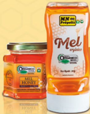
Organic Honey 200g, 280g & 550g