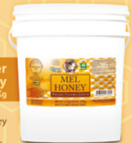
Wild Flower Pure Honey 25Kg

Ingredients: Organic Honey and Organic Bee Pollen