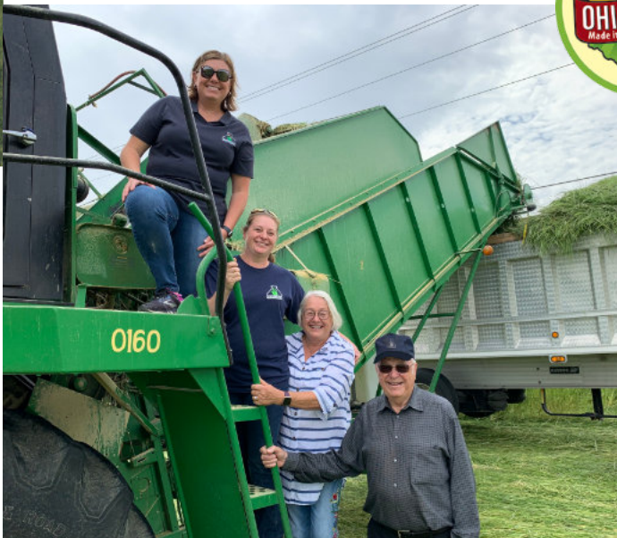
Women operated and family-owned for three generations.