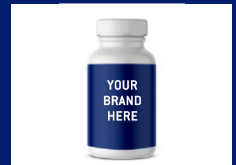
Your Bottled Formula