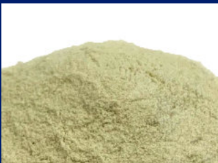
Flower Pollen Extracts