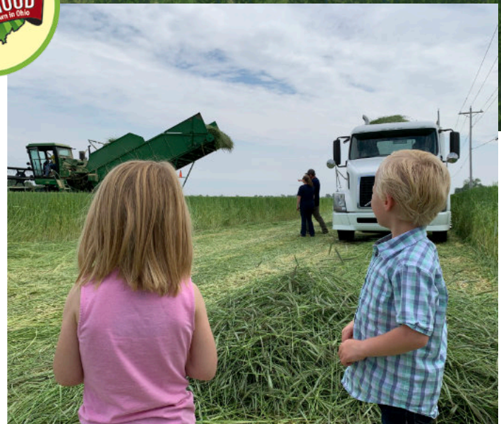
Fourth generation surveying harvest.