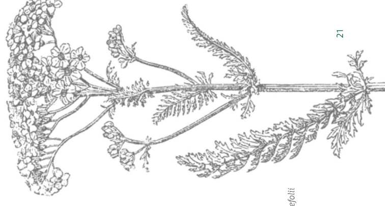
YARROW Achillea millefolii

* Status of individual dossiers to be checked with dossier owner