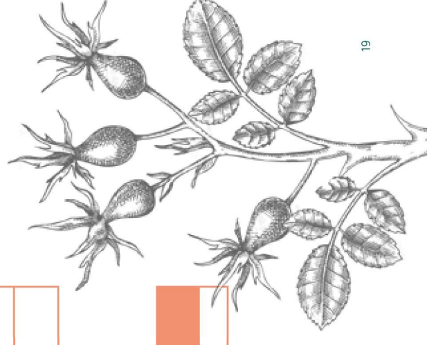
ROSEHIP Cynosbati fructus

* Status of individual dossiers to be checked with dossier owner