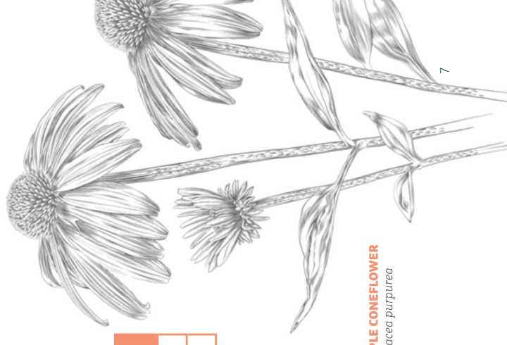
PURPLE CONEFLOWER Echinacea purpurea

* Status of individual dossiers to be checked with dossier owner