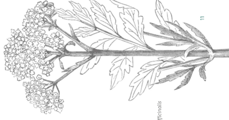
VALERIAN Valeriana officinalis

* Status of individual dossiers to be checked with dossier owner