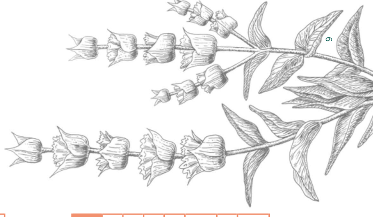
GREEK MOUNTAIN TEA Sideritis species

* Status of individual dossiers to be checked with dossier owner