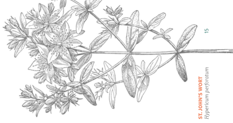
ST. JOHN'S WORT Hypericum perforatum

This list is not exhaustive and subject to change. Please contact us for more details.