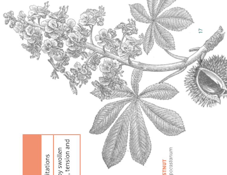
HORSE CHESTNUT Aesculus hippocastanum

* Status of individual dossiers to be checked with dossier owner