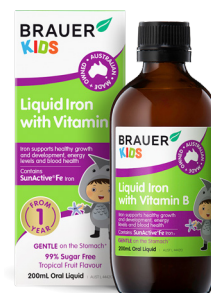
Liquid Iron with Vitamin B