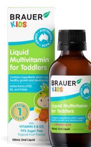
Liquid Multivitamin for Toddlers