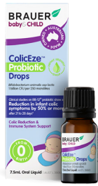
ColicEze™ Probiotic Drops