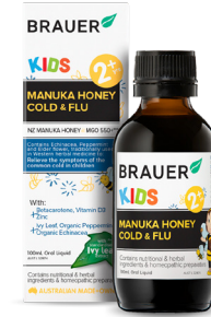
Kids Manuka Honey Cold & Flu