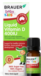
Liquid Vitamin D 400IU