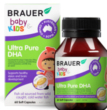
Ultra Pure DHA