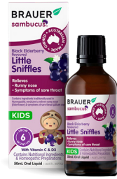
Brauer Sambucus Little Sniffles