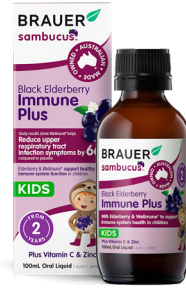
Brauer Sambucus Immune Plus