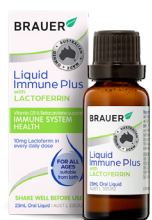
Liquid Immune Plus

No artificial colours, flavours or sweeteners