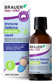
Immune Defence Probiotic Liquid