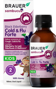
Brauer Sambucus Cold & Flu Forte Kids