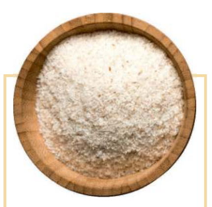
Psyllium Husk 99%