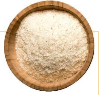
Psyllium Husk 98%