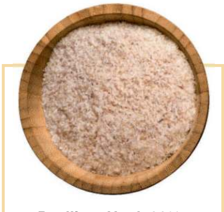
Psyllium Husk 90%