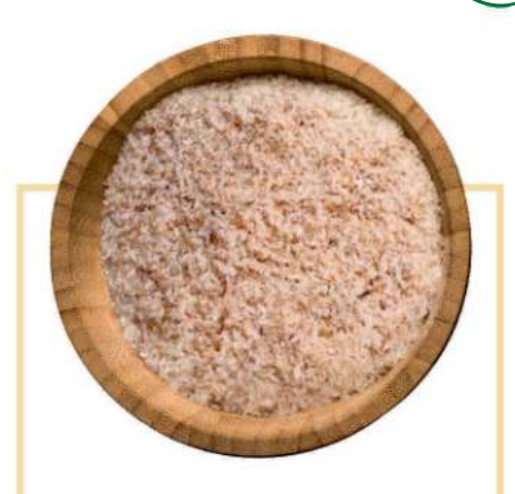
Psyllium Husk 85%