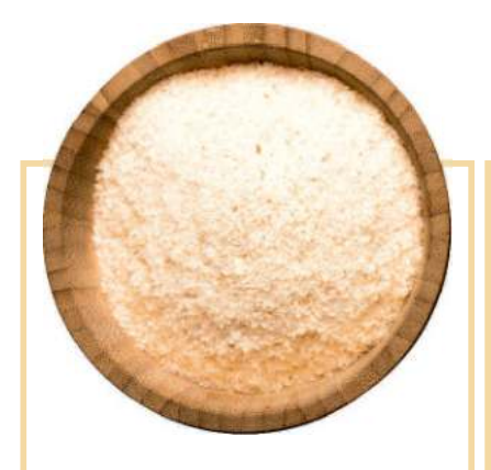
Psyllium Husk 95%