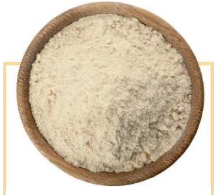
Psyllium Husk Powder 98%