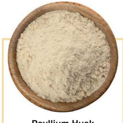
Psyllium Husk Powder 95%