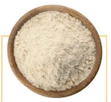
Psyllium Husk Powder 99%

All Above Purity in Following mesh Size: 40/60/80/100